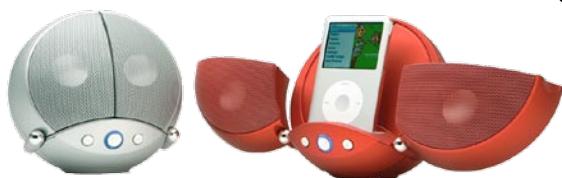
From top: The oh-so-sexy MacBook Air, MacSpeech Dictate is your girl friday, Drobo will save your tax returns and your porn, and cute and sexy Vestalife Ladybug speakers